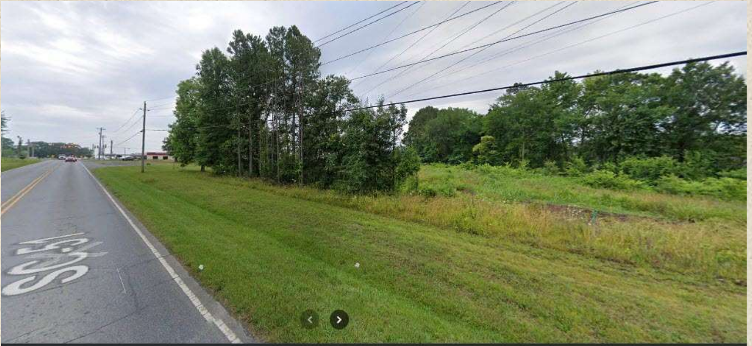
Photo below shows view from Hwy. 51 going east toward Pineville, NC. This site has approximately 350' of front on 51 & 330' on Flint Hill Rd.