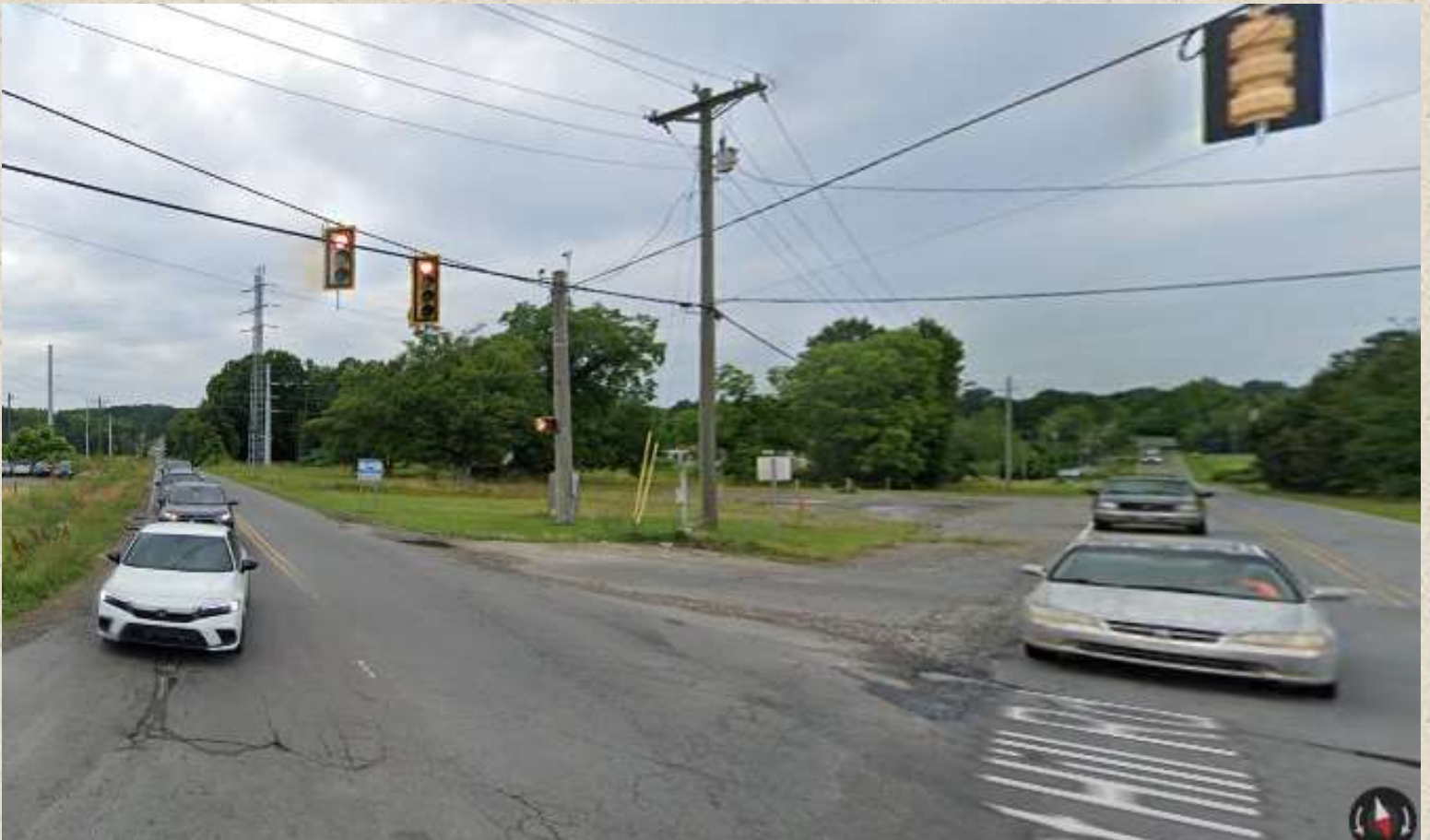
Photo above shows the view along Flint Hill Road. Co. water line along Hwy. 51, sewer line on Flint Hill Rd.

All information is deemed to be accurate but not guaranteed or warranted by REID Real Estate its Agents nor the Property Owner/s. All information subject to change.