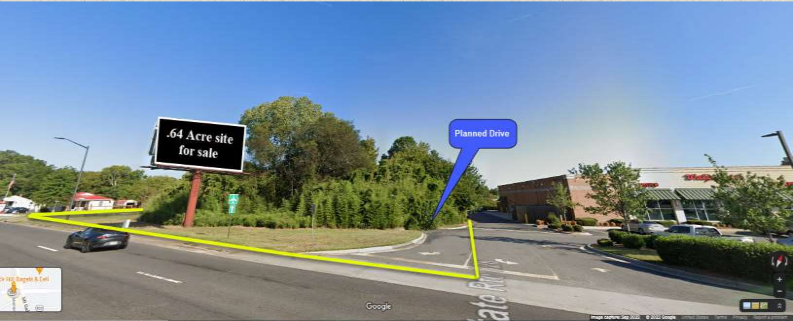
Photo below shows the existing shared curb cut on Celanese and where the drive will go into this site. A second curb-cut on to Aldersgate will likely be permitted also. Close proximity of property lines are indicated with the yellow lines.

This corner is presently located in York County, but it adjoins other properties that are in the city limits of Rock Hill so therefore the property will have to be annexed into the city limits during the permitting phase.